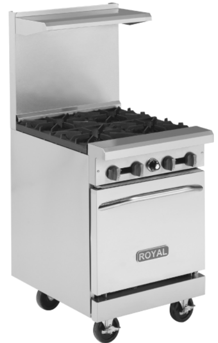
RR-4 Shown With Optional Casters