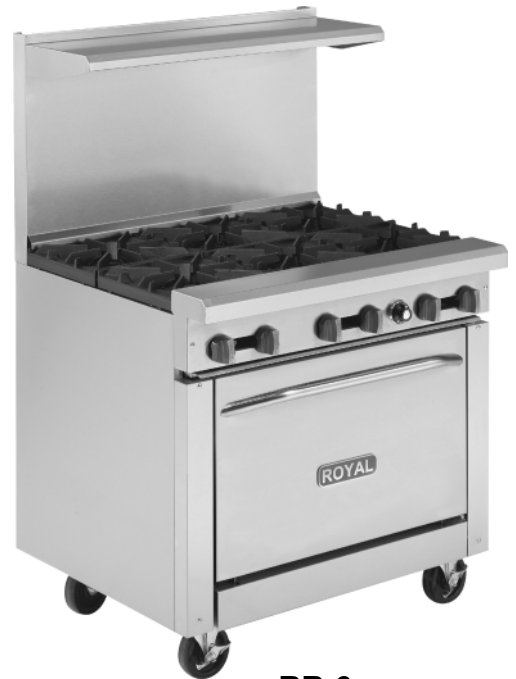
RR-6 Shown with optional casters