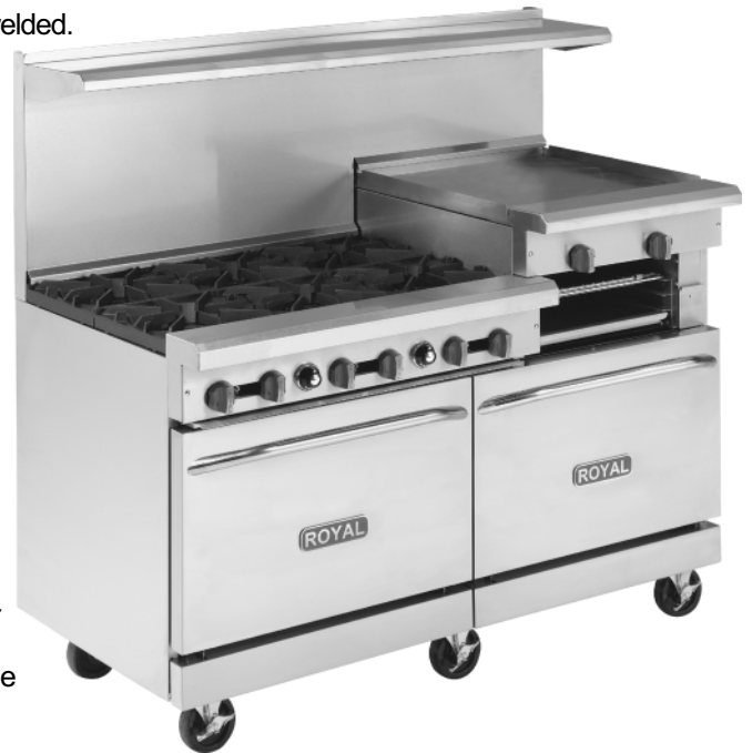
RR-6RG24 Shown With Optional Casters