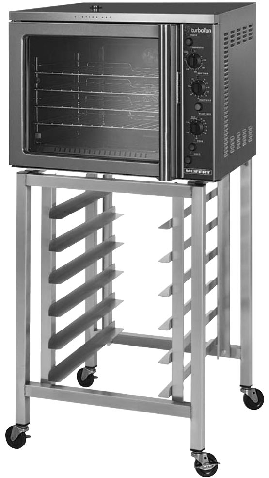
E311MS shown on optional A25CW stand