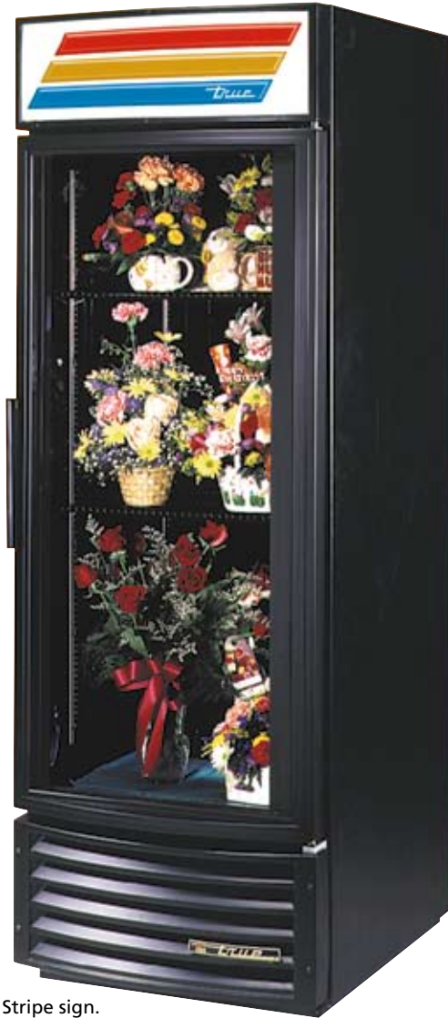
Shown with optional True Stripe sign.

Glass Door Merchandiser: Radius Front Floral Case