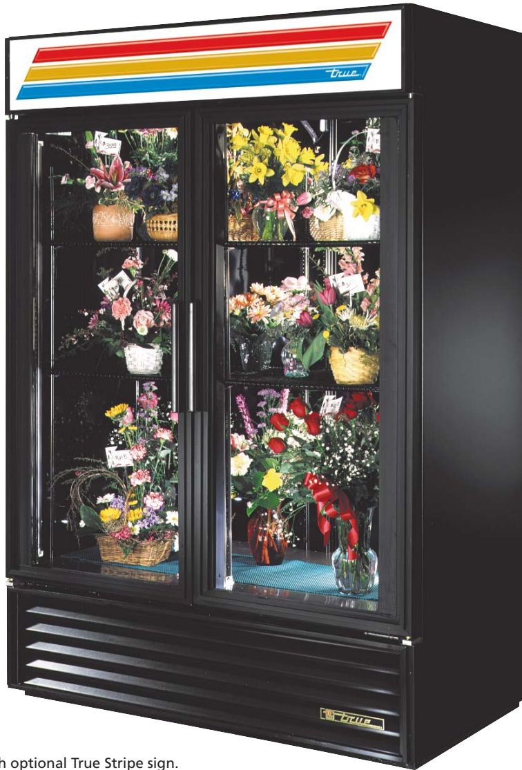
Shown with optional True Stripe sign.