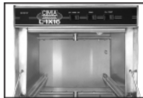
Upper and lower rotating wash arms guarantee excellent results.