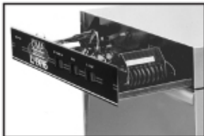
"Works-in-a-drawer", may be removed by disconnecting wires from terminal block.