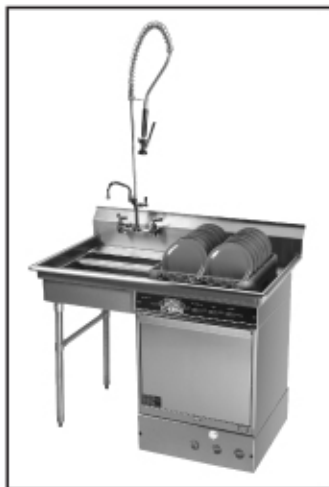
Optional dishtable, faucet and pre-rinse unit sold separately.