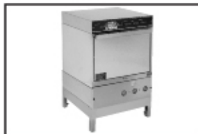
Optional pedestal allows the L-1X16 to be raised up to a full 12" off the floor for easy operator use. Height adjustable from 8" to 12".