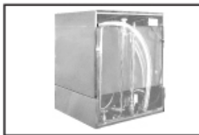
Pumped drain will drain uphill. Requires no floor drain.