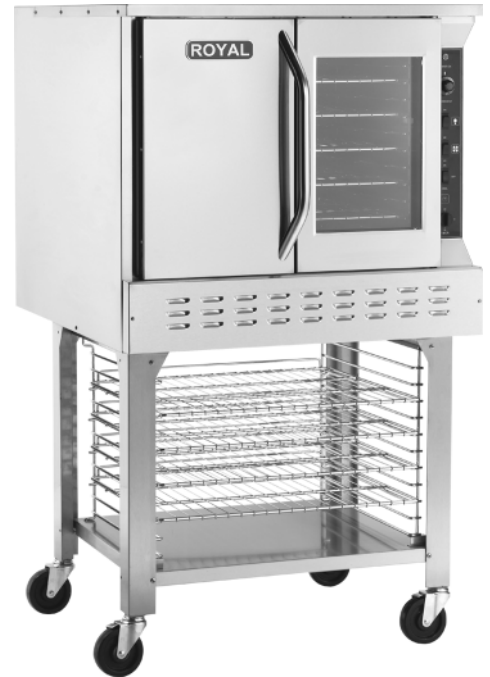
RCOS-1 Shown With Optional Rack Guides, Racks, and Casters

Royal Convection Ovens are engineered for outstanding performance, long life and maximum value. They are constructed with a rugged interior frame, stainless steel sides, top and front. The interior surfaces are porcelain coated for durability and easy cleaning. The ample oven chamber accommodates full size sheet pans. Unlike many other brands we include as standard a glass viewing door on the right, adjacent to the controls for easier regulation while monitoring the food product inside. In addition, our unique design permits stacking two single ovens in the field with simple tools and requires no additional flue exhaust kit.