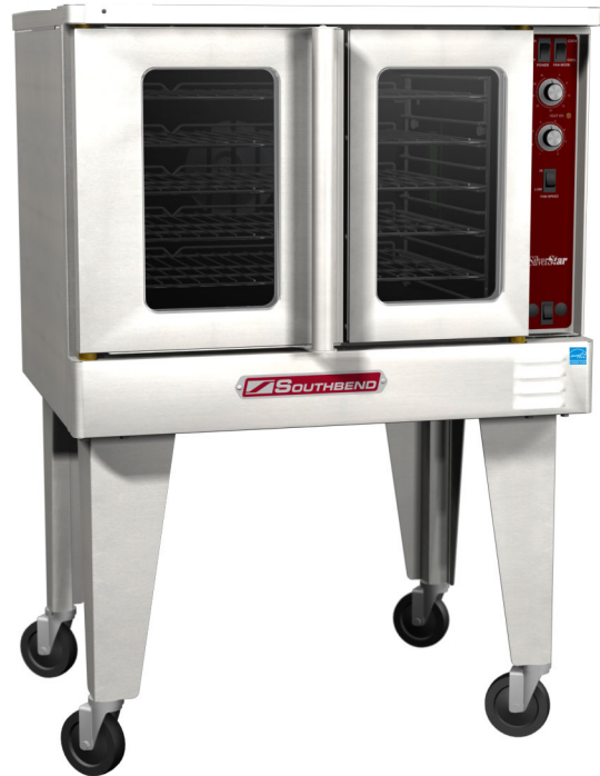
(SLES/10SC shown with optional casters)

SLES/10SC, SLES/10CCH SLEB/10SC, SLEB/10CCH